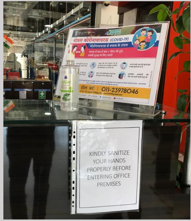
Use Posters at Multiple Places to Spread Awareness