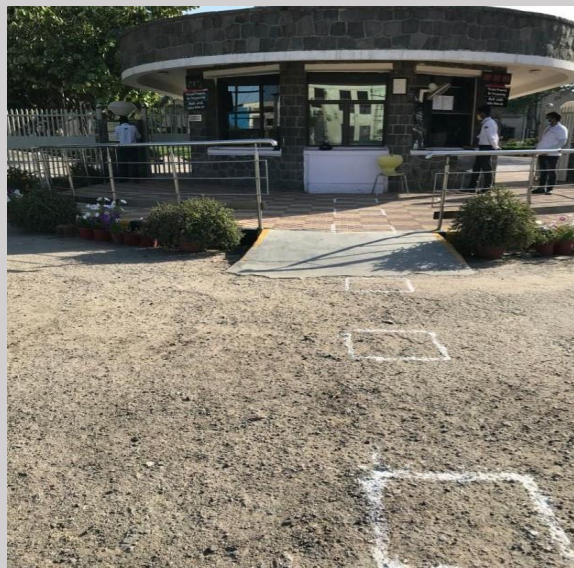
Use Walking Guides Everywhere