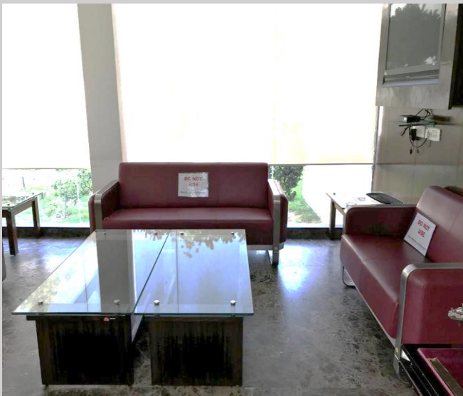
The Sofas here have “Do Not Use” Signs Pasted in Red. One can even use barricades to keep such areas out of bounds

Objects such as Water Coolers can be Tricky. Social Distancing Markers should be pasted on the path leading to them. Use Automatic Water Dispensers or those with a no-touch mechanism to refill bottles