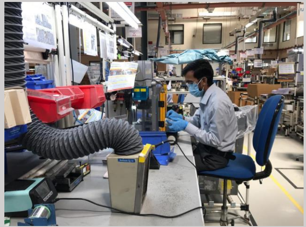
Wearing Masks is Mandatory. Gloves are required for Sensitive Production Process