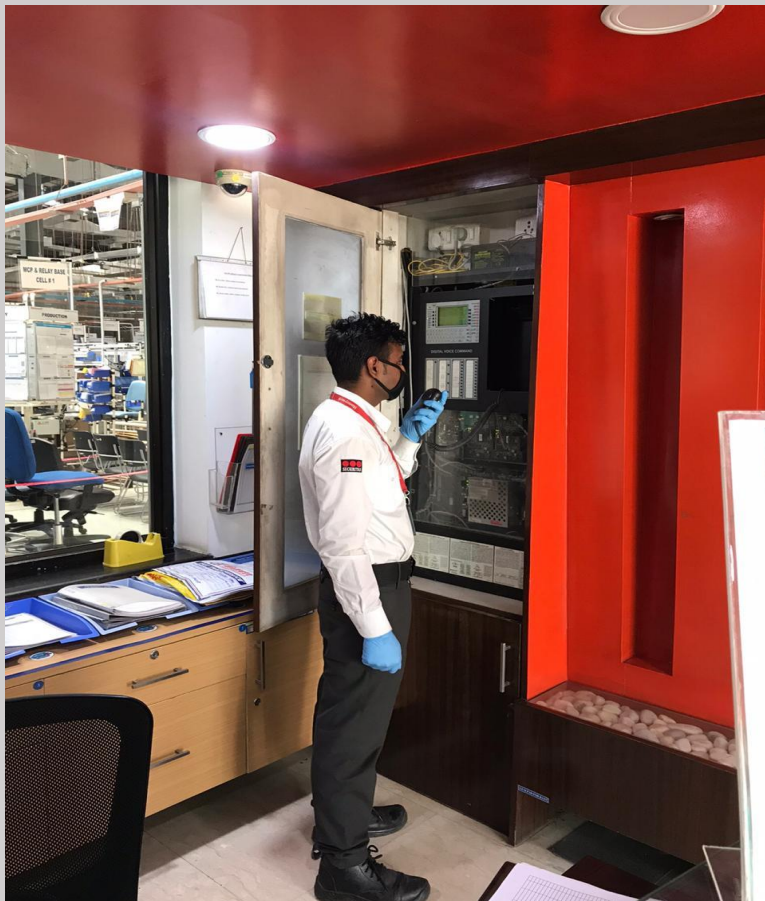
Make Regular Announcements to Reinforce Social Distancing Compliant Behaviour and to Discourage those who Flout it