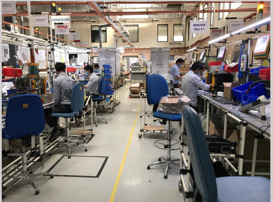
Model Process Floor with Appropriate Social Distancing