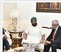
PUNJAB CM SEEKS INVESTMENT FROM US COMPANIES IN MEETING WITH NEW JERSEY SENATOR