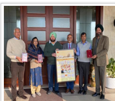
Punjab Chief Minister Captain Amarinder Singh On Saturday Released The Punjab Government's Diary And Calendar For