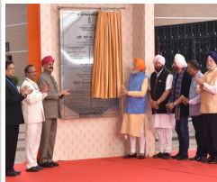
Prime Minister Narendra Modi Along With Punjab Governor VP Singh Badnore And Chief Minister Captain Amarinder Singh Inaugurating The Integrated Check Post At Dera Baba Nanak To Mark The Opening Of Kartarpur Corridor On Saturday.