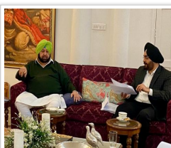
CAPT AMARINDER MEETS NHAI CHAIRMAN, BOTH AGREE ON EXPEDITIOUS COMMENCEMENT OF WORK ON DELHI-