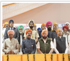
The President Of India Ram Nath Kovind, Governor Punjab VP Singh Badnore And Punjab Chief Minister Captain Amarinder Singh, Rajasthan Chief Minister Ashok Gehlot, Patiala Member Parliament Preneet Kaur, Cultural Affairs Minister Charanjit Singh Channi