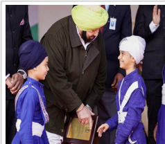
Punjab Chief Minister Captain Amarinder Singh Presenting A Memento To The Budding Gatka Players On 71st Republic Day Function At SAS Nagar (Mohali) On Sunday.