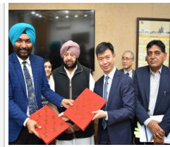
PUNJAB INKS MoU WITH SINGAPORE'S CIG TO EXPLORE LEADERSHIP TRAINING, SHOWCASE STATE AS INVESTMENT DESTINATION