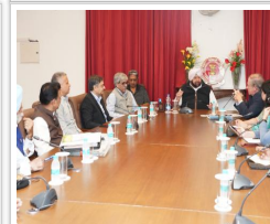
CAPT AMARINDER SEEKS WB SUPPORT TO HELP PUNJAB'S FARMERS SHIFT TO ALTERNATE CROPS TO BOOST INCOME & SAVE WATER