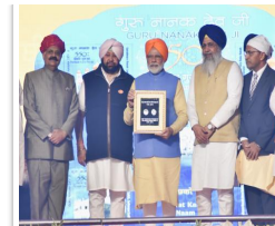
CAPT AMARINDER SINGH HOPES CORRIDOR WOULD LEAD TO PEACEFUL ENVIRONMENT BETWEEN BOTH COUNTRIES LEADING TO EASY ACCESS TO OTHER GURDWARAS