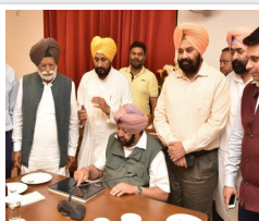
CAPT AMARINDER LAUNCHES 1ST OF ITS KIND 'PUNJAB JOB HELPLINE' FOR UNEMPLOYED YOUTH