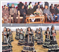
Punjab Chief Minister Captain Amarinder Singh Along With Dignitaries Witnessing The Cultural Programme On 71st Republic Day Function At SAS Nagar (Mohali) On Sunday.