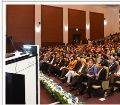
PUNJAB GOVT COMMITTED TO TRANSFORMING MSMEs INTO INDUSTRIAL GIANTS: VINI MAHAJAN