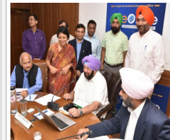
PUNJAB GOES TOTALLY HI-TECH AS CAPT AMARINDER LAUNCHES EOFFICE FOR ELECTRONIC FILE MOVEMENT