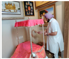
CAPT AMARINDER LEADS BAIKAKHI PRAYERS WITH OWN ARDAS AT 11, THANKS PEOPLE FOR STAYING IN