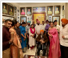
A ROOM SEEPED IN VALOUR - CAPT AMARINDER'S ODE TO 2 SIKHS