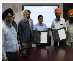
PUNJAB INKS MoU WITH INDUSTRIAL ASSOCIATIONS & GNDEC-LUDHIANA TO PROMOTE RESEARCH & INNOVATION