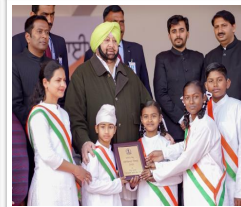
Punjab Chief Minister Captain Amarinder Singh Presenting A Memento To A Group Of Specially-Abled Children Which Performed National Anthem During 71st Republic Day Function At SAS Nagar (Mohali) On Sunday.