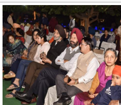
STUPENDOUS FLOATING MULTIMEDIA LIGHT AND SOUND SHOW DRAWS UNPRECEDENTED RUSH OF PEOPLE