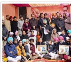
AT PUNJAB CONGRESS PROTEST DHARNA, CM DECLARES 'WE WILL NOT TOLERATE ANY ATTEMPT TO TINKER WITH