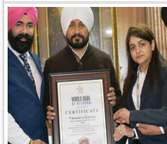
VIRASAT-E-KHALSA BAGS ANOTHER AWARD, GETS LISTED IN 'WORLD BOOK OF RECORDS'