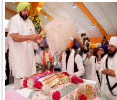
CAPT AMARINDER USHERS IN WEEK-LONG 550TH PRAKASH PURB CELEBRATIONS AT SULTANPUR LODHI WITH GURU GRANTH SAHIB SAROOP SEWA