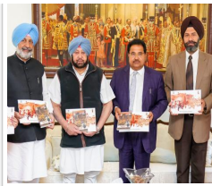
Punjab Chief Minister Captain Amarinder Singh Released A Booklet 'Because We Haven't Forgotten...' Along With A CD Of Documentary Film 'Jallianwala Bagh Punjab Da Dil' In Punjabi And Hindi Dedicated To Jallianwala Bagh Centenary Commemoration