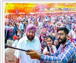
Ghar Ghar Rozgar & Karobar Mission' Scheme, Punjab Chief Minister On Saturday Declared All-Out Efforts To Identify The Poorest Of The Poor Jobless In Villages For Employment, Even As He Announced A Free Coaching Scheme For Candidates To Prepare For Group