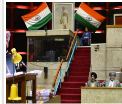
Punjab Chief Minister Captain Amarinder Singh During Fourth Day Of Budget Session Of Punjab Vidhan Sabha On Wednesday.