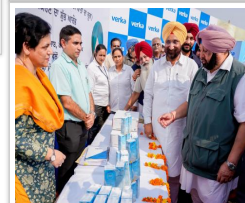
CAPTAIN AMARINDER SINGH LAUNCHES VERKA'S PIO NATURAL VANILLA MILK & CHEALTED MINERAL MIXTURE