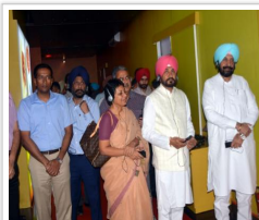
CABINET MINSTER CHARANJIT SINGH CHANNI AND BALBIR SINGH SIDHU LAUNCHED 4-MONTH ELABORATE PROGRAMME TO COMMEMORATE GURU SAHIB'S MEMORY