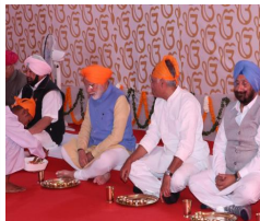
PM ALONG WITH CAPTAIN AMARINDER PARTAKES LANGAR IN PUNJAB GOVERNMENT PANDAL