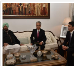
JAPANESE AMBASSADOR MEETS CAPT. AMARINDER, DISCUSSES INVESTMENT OPPORTUNITIES IN PUNJAB