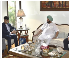
CAPT AMARINDER MOOTS A PUNJAB IRAN CHAMBER OF COMMERCE TO BOOST TRADE, INVITES IRANIAN ENVOY TO 550TH PRAKASH PURB