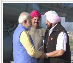
Prime Minister Mr. Narendra Modi Being Received By Punjab Governor Mr. VP Singh Badnore And Chief Minister Captain Amarinder Singh At Bussawal Village In Sultanpur Lodhi On Saturday.