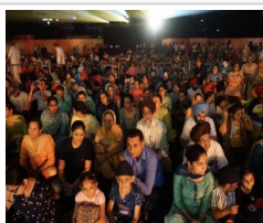
MORE THAN 8800 VISITORS VISIT LIGHT & SOUND SHOW ALONG WITH DIGITAL MUSEUM IN LUDHIANA