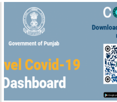
Corona Mobile APP