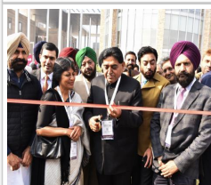
PPIS 2019 KICKS OFF WITH EXHIBITION SHOWCASING PRODUCTS OF TOP INDUSTRIES, MSMEs & STARTUPS