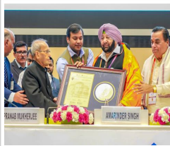
CAPT AMARINDER CONFERRED WITH 10th BCS 'IDEAL CHIEF MINISTER' AWARD FOR UNIQUE INITIATIVES TO BOOST STATE'S HOLISTIC GROWTH