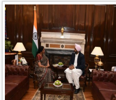
MANPREET BADAL SEEKS EARLY RELEASE OF GST ARREARS FROM NIRMALA SITHARAMAN