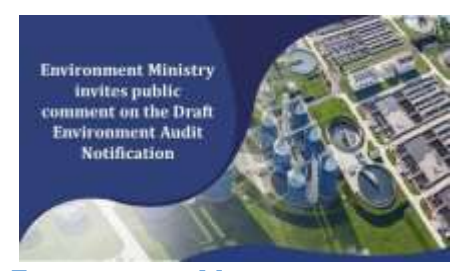
Environment Ministry invites public comment on the Draft Environment Audit Notification