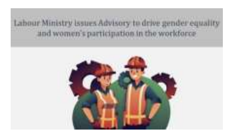
Labour Ministry issues Advisory to drive gender equality and women's participation in the workforce