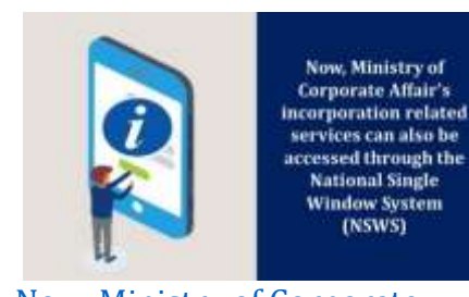
Now, Ministry of Corporate Affair's incorporation related services can also be accessed through the National Single Window System (NSWS)