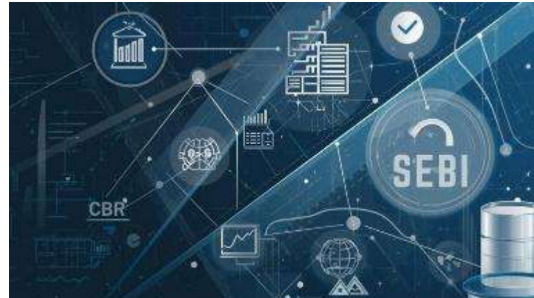
SEBI issues (Issue of Capital and Disclosure Requirements) (Second Amendment) Regulations, 2025 revising the list of person required to hold specified securities in dematerialized form