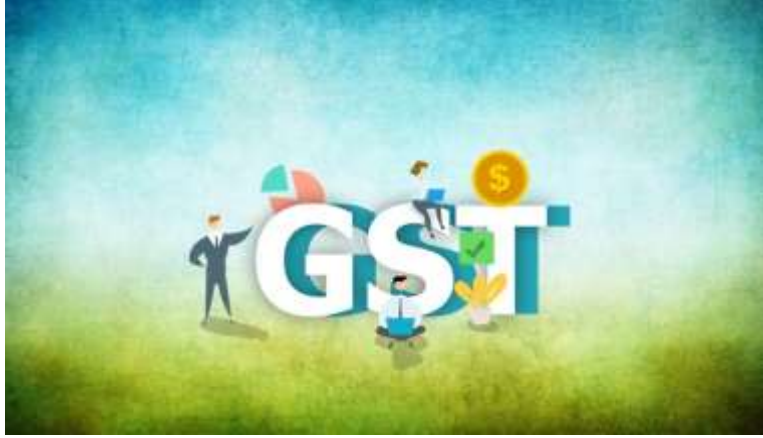
Key Highlights on the outcome of the 56th GST Council Meeting