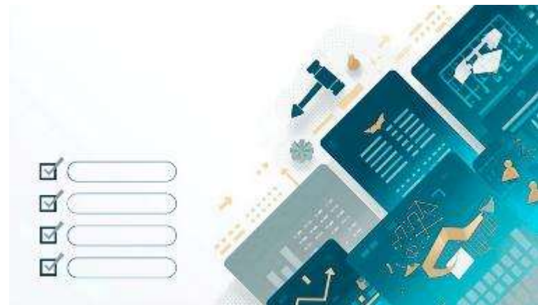
SEBI issues Listing Obligations and Disclosure Requirement (Third Amendment) Regulations, 2025.