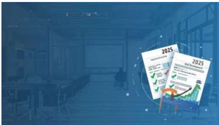
Ministry of Skill Development and Entrepreneurship notifies Apprenticeship (Amendment) Rules, 2025; total strength with respect to engaging apprentices in a financial year stands revised