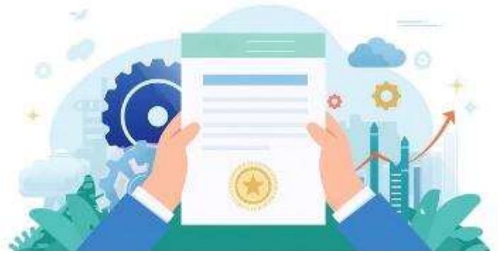
Ministry of Skill Development and Entrepreneurship notifies new list of industries to which Apprentices Act will apply